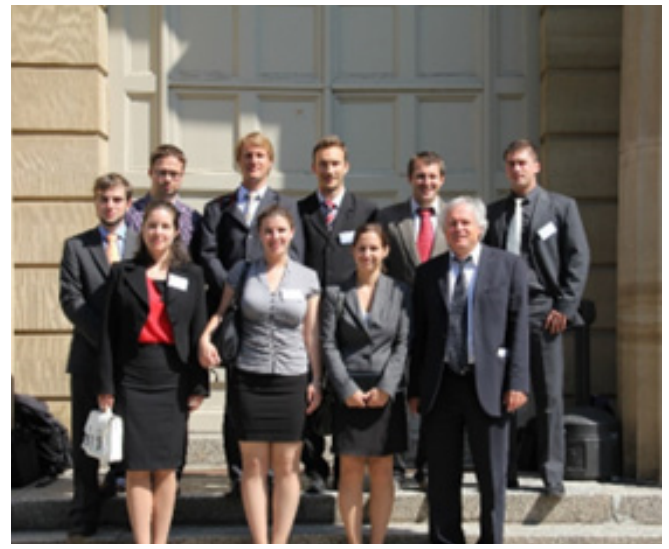
Fig. 5: Participants from BME, Hungary, at the PhD Symposium 2012 KIT Karlsruhe, Germany