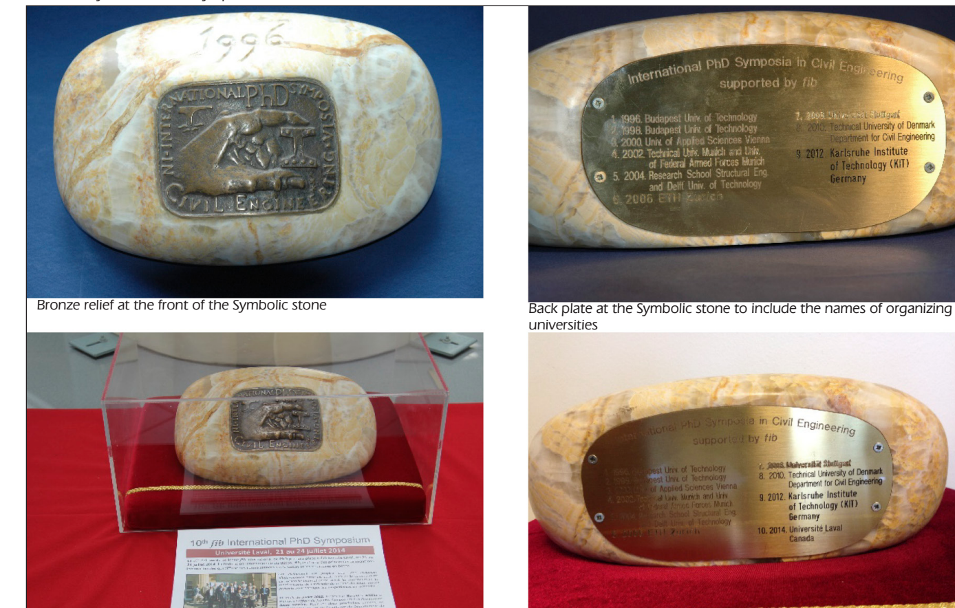
Fig. 2: The Symbolic Stone of the PhD Symposia at the events at Karlsruhe Institute of Techn. (KIT), PhD Symposium 2012 and at Université Laval, Quebec City, Canada, PhD Symposium 2014

forum above their PhD programmes to present and discuss the results of their ongoing research and to collect advice on how to continue the research. This forum should have been very similar to what we generally have for technical or scientific presentations and to gather opinions on a large scale. It is called PhD Symposium.